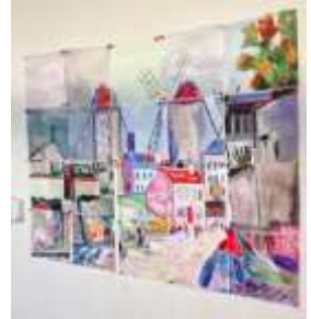
Group student painting

August 9 – September 27, 9AM – 12PM, $285